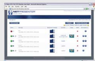
Netpresenter Editor or Message Server, for content creation and management.