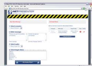
Emergency Alert Server, for emergency alerts broadcasts and pop-ups.