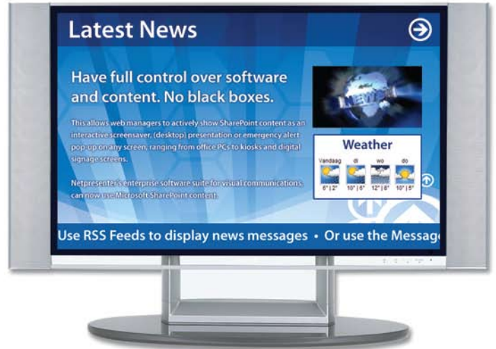
TV Player for Digital Signage and Emergency Alerts