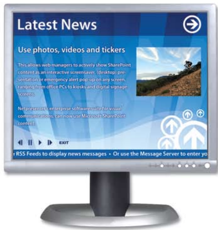
PC Screensaver, Desktop Player, Emergency Alerts, Pop-ups