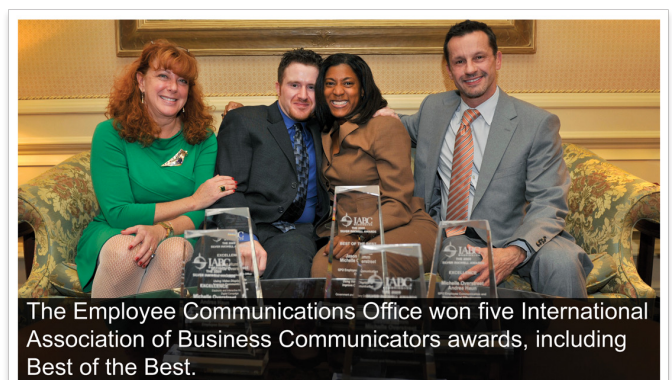
The Employee Communications Office won five International Association of Business Communicators awards, including Best of the Best.

This successful project also won GPO the prestigious ‘Best of the Best’ Silver Inkwell Award from the International Association of Business Communicators (IABC/Washington). The Award was won because GPO managed to improve its overall communication significantly, increasing employee satisfaction, motivating and inspiring staff and making everyone – blue and white collars, and those based at the headquarters and in field offices – feel part of the team. Setting an excellent example for other organizations looking for ways to bridge similar gaps. →