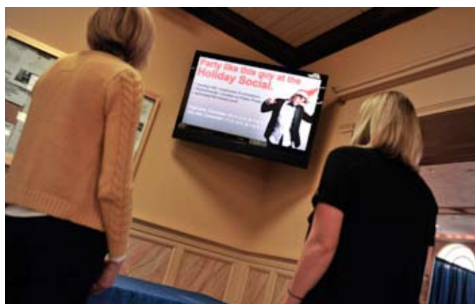
Usage of the Netpresenter system at GPO

“Despite our use of a variety of print and electronic channels, our research found it wasn’t meeting the communication needs for a large portion of our 2,400 employees. We also found that many felt unrecognized for their contributions. To counter this, we implemented Netpresenter in 2008. To reach both blue and white collar staff, content is now broadcasted 24x7 on 50 wall-mounted monitors throughout the GPO campuses. The same content is pushed out to the screensavers of all agency desktops and kiosks in production areas. Keeping everyone equally well informed,” says Jeffrey Brooke, Director, Employee Communications at United States Government Printing Office.